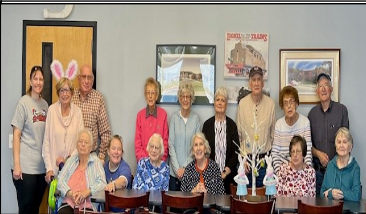
Wharton Class at Easter luncheon at Southbound Sandwich Shop on Good Friday. This was for members and friends.